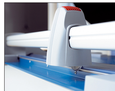
Features a ground self-sharpening rotary blade that cuts in either direction.