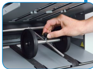
Adjustable stacker wheels help to keep folded documents in a neat stack

Formax - New Hampshire, USA www.formax.com