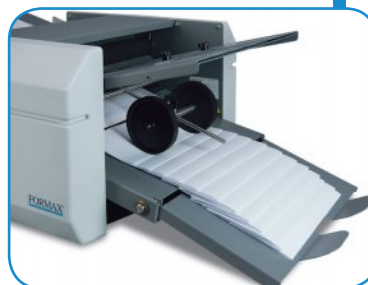
Outfeed conveyor holds folded documents in a sequential order

Quick, Easy Setup: Clearly marked fold settings and removable top and bottom fold plates