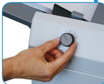
Variable speed control knob

Skew Adjustment: Adjusts feed table left or right for crisp, accurate folds