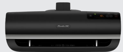
Fusion 5000L series