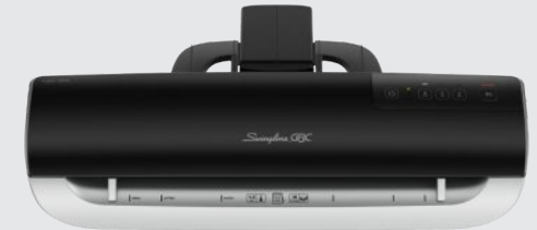
Fusion 3000L series