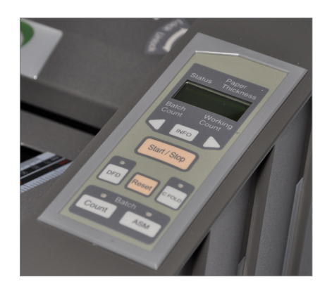
LCD TOUCH PAD CONTROL WITH COUNTER

Advanced sensors detect double feeds and automatically stop the ES5500 to prevent jams.