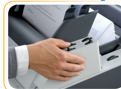
Easy to load feeders

The FD 6102 folds and inserts at speeds up to 1,360 pieces per hour and can hold up to 100 sheets/inserts in each feeder. The semi-automatic mode folds up to five stapled or unstapled sheets of 20# paper in one motion. The document feeder swap mode maximizes output by filling both sheet feeders with the same documents. When the first feeder empties, the second automatically starts feeding without interruption. This feature allows for a total sheet feeder capacity of up to 200 sheets.