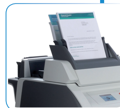
2 Sheet feeders and 1 insert/BRE feeder

Automation saves time, money and reduces the amount of handling, making the document more secure. To ensure the integrity of mailings, the FD 6102 has true double document detection which prevents double feeding. This electromechanical system is not sensitive to paper dust or colored paper, ensuring the right document goes to the correct recipient.