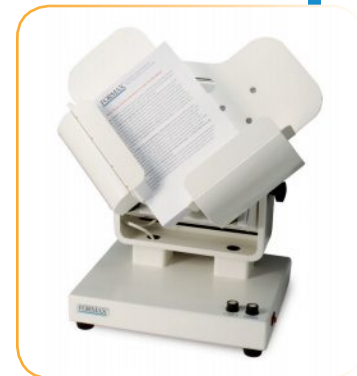
Optional FD 402TA1 Jogger: Air Jogger dries and reduces static electricity from forms and aligns them for proper feeding

Formax - New Hampshire, USA www.formax.com