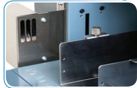
Optional Side Air Kit: Enhances feeding of heavy stock and large paper sizes