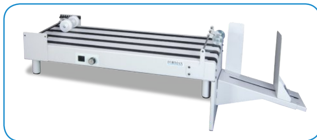
FD 282-30 Drop-Stacking Conveyor

Formax - New Hampshire, USA www.formax.com