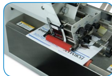
Applicator and rollers ensure tab is tightly folded and sealed