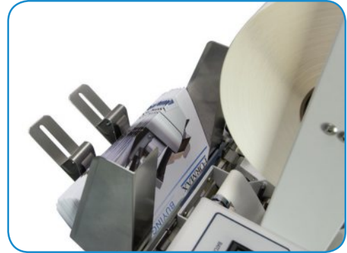
Integrated bottom feed for continuous operation

The Formax FD 262 Single-Head Tabber makes quick work of applying tabs to folded mailpieces, and is designed to meet all USPS requirements for mailing and automation discounts. Using “crash tab” technology, the open edge of a mailpiece contacts an adhesive tab and travels through a set of rollers where the tab is tightly folded and sealed, creating a mail-ready piece.