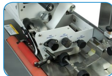
Easily accessible knobs for tab placement and adjustment