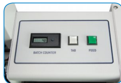
Simple, push-button controls and resettable LCD counter