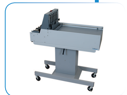
Optional V-Stack36 Vertical Stacker with adjustable-height stand