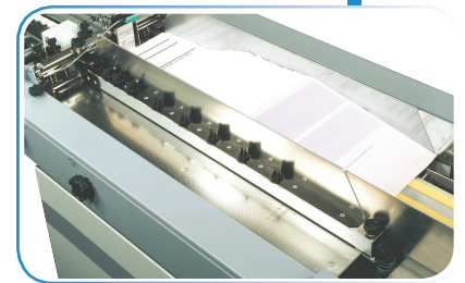
FD 2200 EX