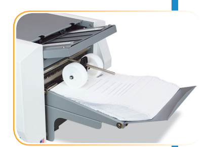
Integrated Output Conveyor

U.S. Patents: 5,772,841 5,865,925 5,968,308 6,264,592 Other Patents Pending