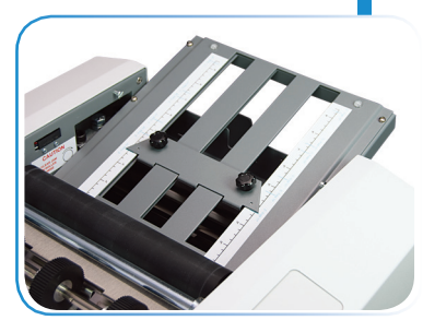
Redesigned fold plates -Clearly marked and easier to adjust

Formax - New Hampshire, USA www.formax.com