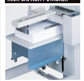
The high capacity stacker can stack up to 3,200 collated sheets (straight or offset).