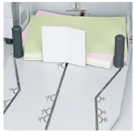
The criss-cross stacking feature allows easy set separation.