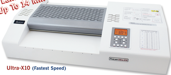
Ultra-X10 (Fastest Speed)