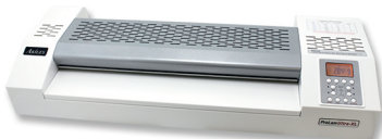
Ultra-XL (Extra Large 18.9" Opening)