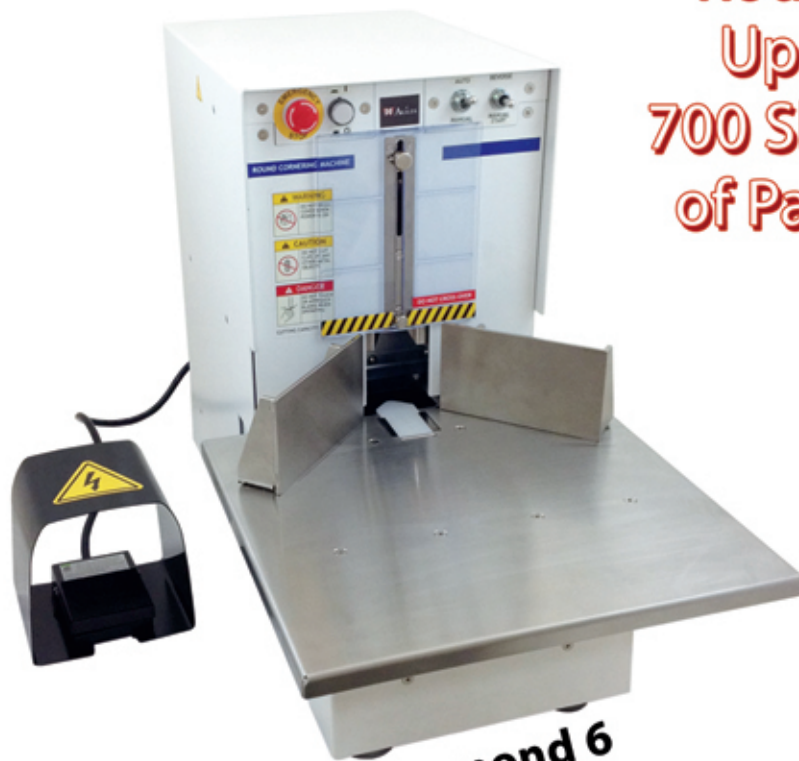
Diamond 6 (600 sheets)