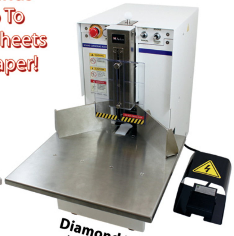
Diamond 7 (700 sheets)