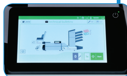
Color Touchscreen Control Panel with graphical interface