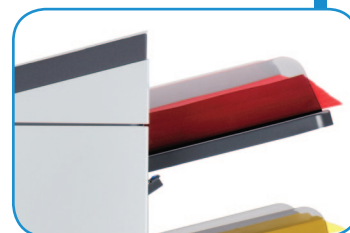
High-Capacity Document Feeder