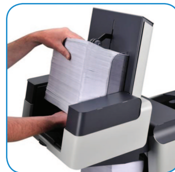
High-Capacity Vertical Output Stacker