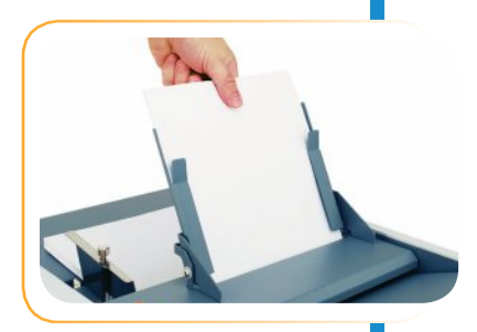
Optional Multi-Sheet Feeder