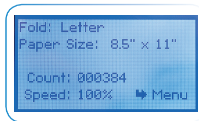
Large LCD Screen