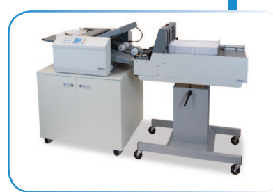
FD 2054 in-line with optional V-Stack36 Vertical Stacker, stand and cabinet

Formax - New Hampshire, USA www.formax.com