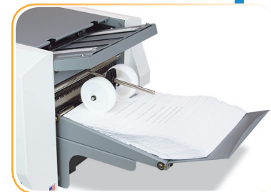
Integrated Output Conveyor

The FD 1502 Plus is built with proven Formax technology. Heavy-duty steel construction offers the dependability and power expected of a larger unit in a smaller package. A hopper capacity of up to 200 forms and processing speed of up to 6,250 forms per hour enables an operator to complete daily jobs in no time. Plus, the integrated output conveyor keeps processed forms in a neat, sequential order.