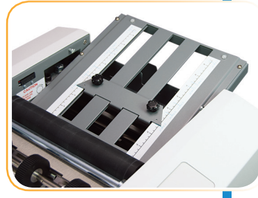
Redesigned fold plates -Clearly marked and easier to adjust

U.S. Patents: 5,772,841 5,865,925 5,968,308 6,264,592 Other Patents Pending