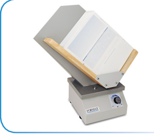
402 Series Jogger - an option which reduces static electricity from forms and aligns them for proper feeding